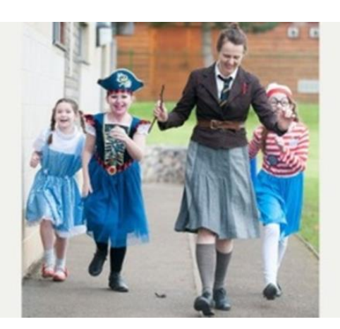
Book Character Day