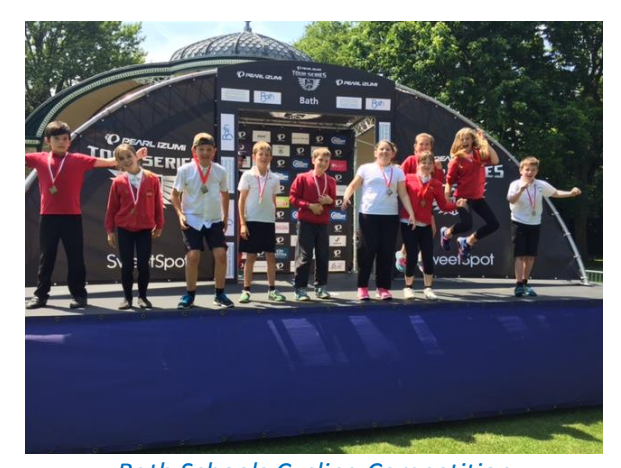
Bath Schools Cycling Competition