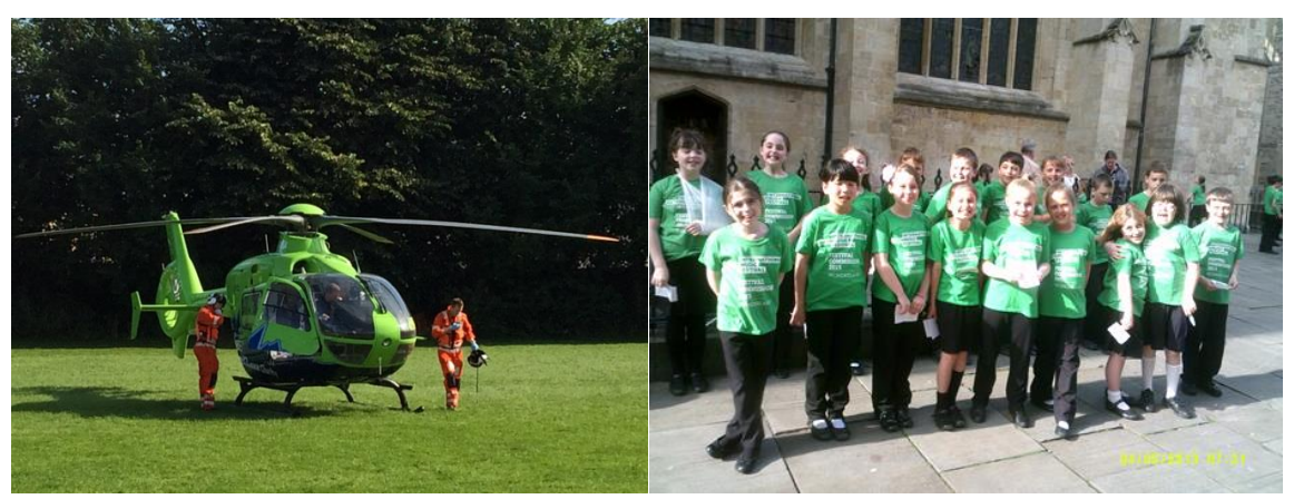
Surprise Helicopter Landing

As you would expect, lots of events have happened over the past year, involving the children, staff and parents! Here are a collection of photos to remind us of just a few!