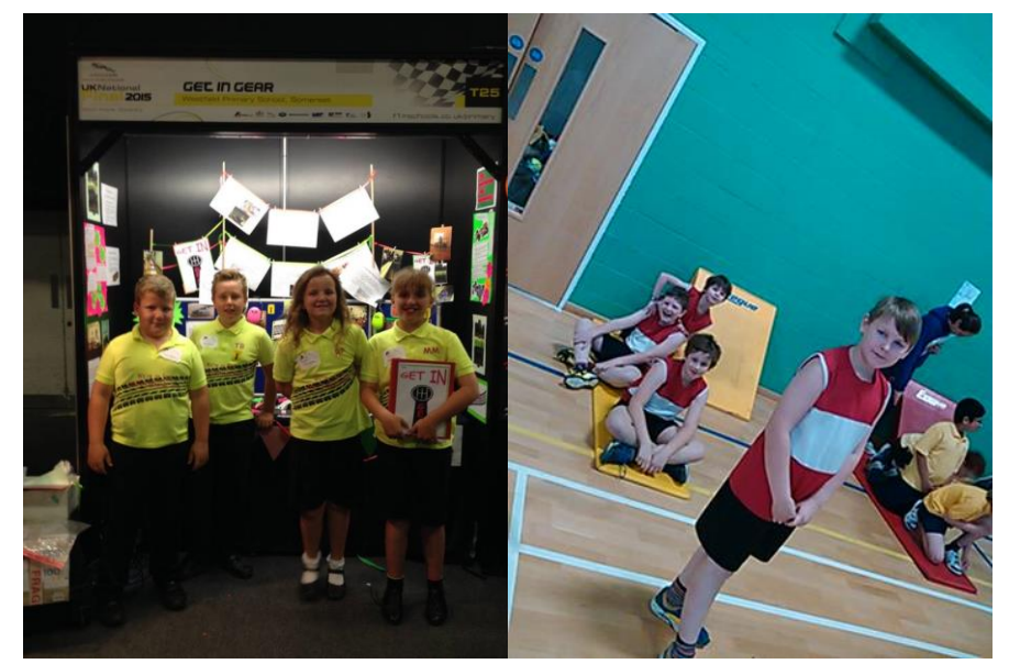
National Finals – Formula 1 Project