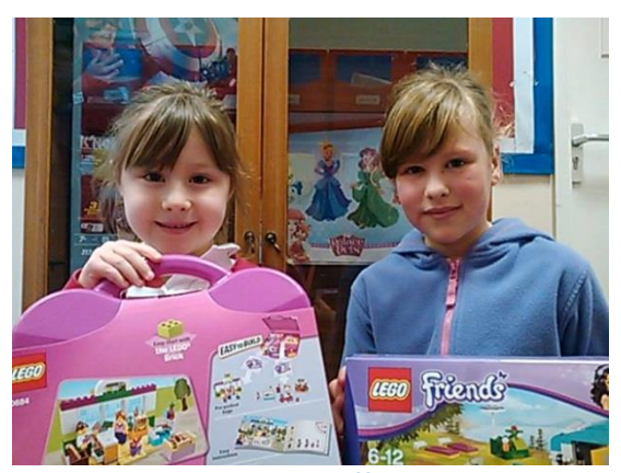
Home Reading Raffle Winners